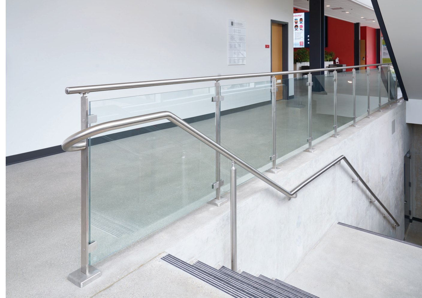
Surface Blade Legato™ and Welded Handrail

Diercks Hall Milwaukee, WI