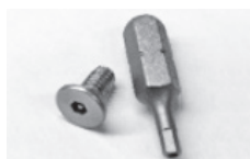
Stainless Steel Security Screw and Driver Bit