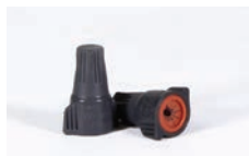
Silicone Gel Filled, Wet Location Wirenuts